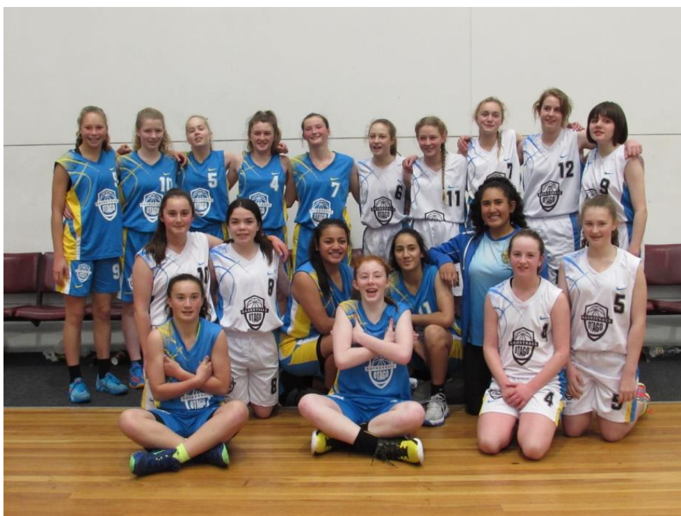
Under 15 A & B girls

The team went 3-0 and let their full court defence dictate their offence with steals and rebounds turning into shots for us on the other end. These games were a team effort and it was nice to be able to get all players out onto the court in preparation for Nationals. In our first game we played our Otago B side at 8am. Our pressure bothered the girls. We were in control the whole game, however the Bs played a much more competitive second half. The second game on Saturday was against Central Otago who we dominated and won 63-29. We had very good second and third quarters, and again our full court pressure and work on the boards were too much for the Central squad. Sunday's lone game was against Southland. There is a bit of a rivalry there and I felt that going into the game, as a lot of the players knew each other. We really put a thumping on them and won 79-12, with all girls again seeing action on the court and contributing. We solidified a place at Nationals with the wins and the girls were fizzing after the weekend.