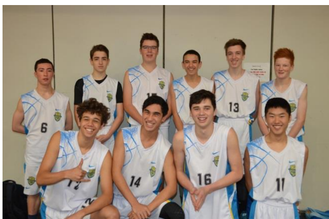
BBO u17 Metro A for Dunedin Qualifying