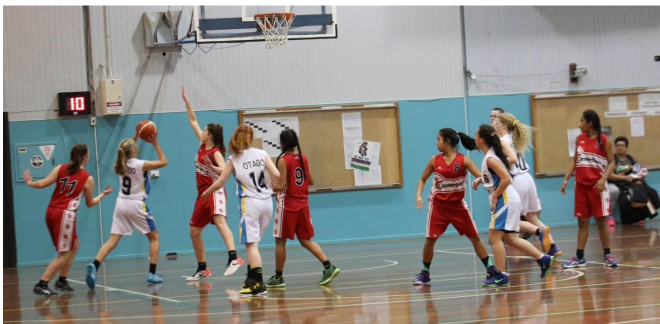
Under 15A girls in Christchurch at Queen's Birthday Weekend Invitational