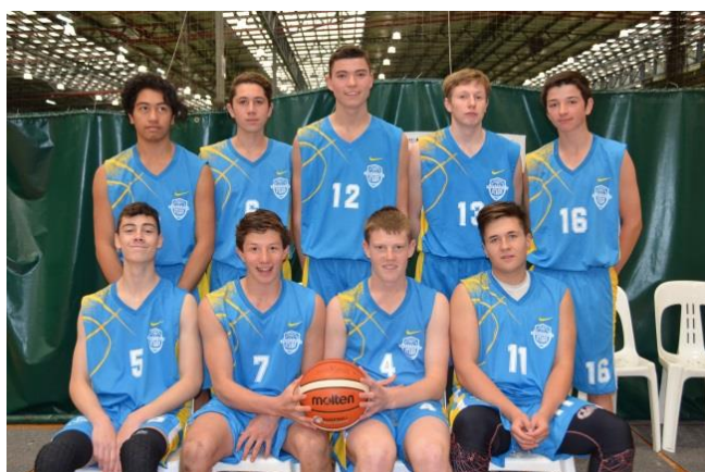
BBO u17 Metro B for Dunedin Qualifying